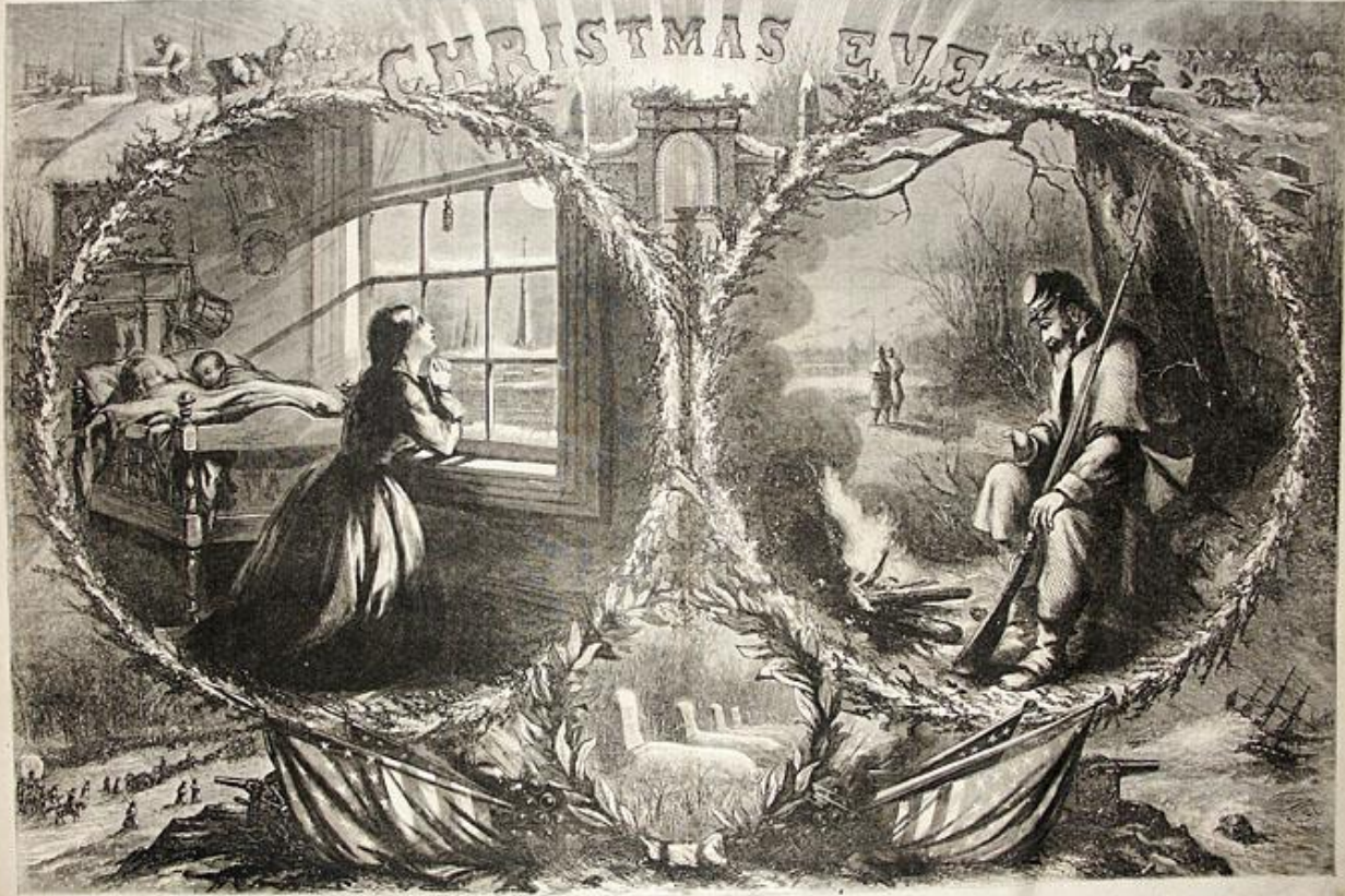
CHRISTMAS EVE, 1862.—[From Page 14.]